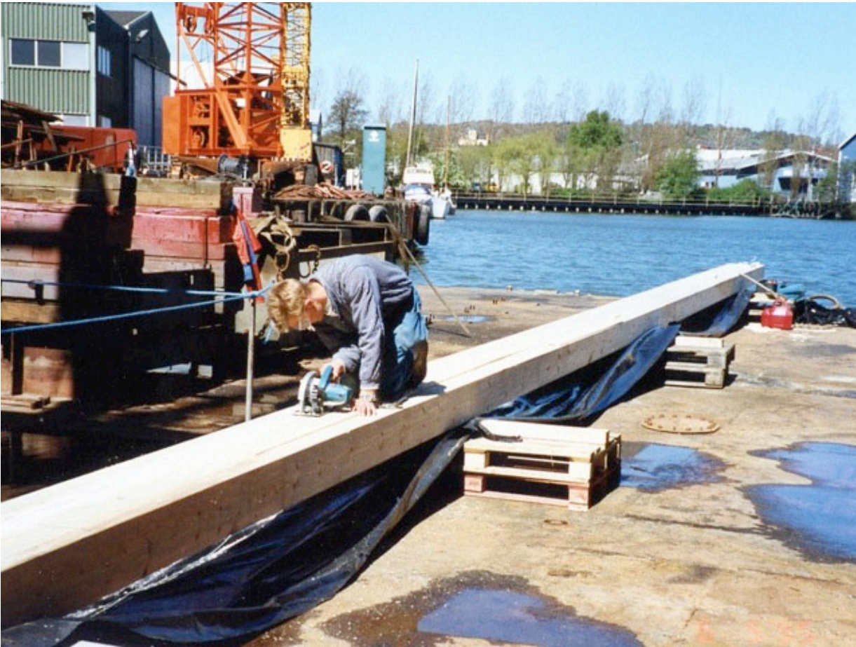
5. New solid oak keelson